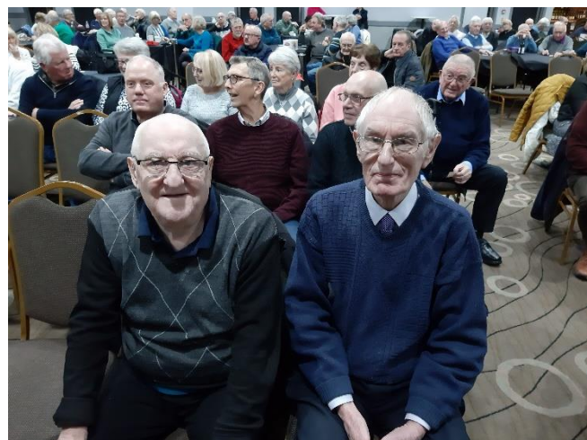
Three pictures of Senior Tigers present at our January 2024 Members' meeting.