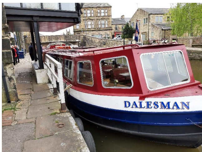
Our barge, "Dalesman"